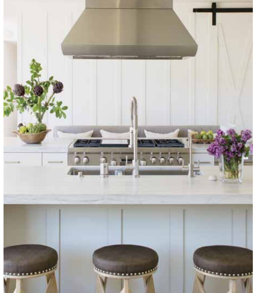
A. Rudin barstools pull up to the kitchen island, which is capped with a quartzite countertop from Tutto Marmo, fabricated by Minicci Stone. The paneling was fabricated by Lorton Mitchell Custom Homes, and the Wolf range is from Pirch.